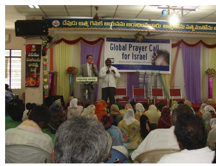
Pastors-Conference in India

By now we have three major events behind us, which have helped us very much, to further clarify the vision and to start the process of implementation: a) Our strategy meetings in Jerusalem, April 21-23 and b) a leadership conference of Christians for Israel International in the Philippines with leaders from 7 Asian nations, where the GPC could be introduced and prayed for, c) and two Pastors-Conferences on the