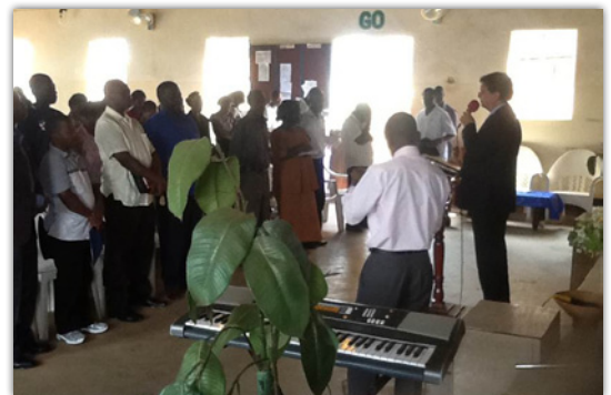
GPC-Meeting in Uganda