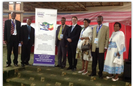
GPC-Meeting in Ethiopia

Those visits in Africa – similar to my experience in India – tell me that those two Global Days of Prayer seem to have great potential to stimulate prayer for Israel as well as for your own nation and its relationship to Israel. After summer break, in September, we will work intensely to prepare flyer and poster focusing on the promotion and implementation of those two prayer days.