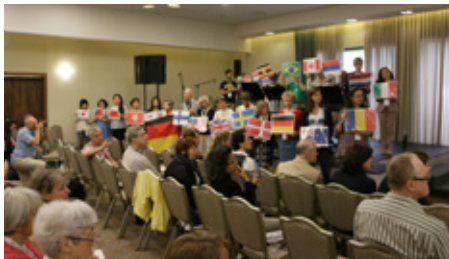
Some of the representatives with flags of their nations at the prayer for Israel and the nations

From May 10 to 12 2015 up to 400 participants from about 35 nations of all continents came together in Jerusalem in order to look back to the 100 days of prayer and (partial) fasting, bring this period to a close and ask the Lord for how to keep up the prayer momentum for the nations in their relationship to Israel in the future.