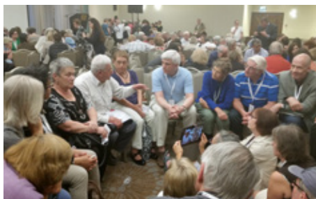
Afternoon with holocaust survivors. Participants sat in 12 groups, interacting and listening to the stories of the survivors.

The second day of the Jerusalem-conference, May 11, was marked by a focus of understanding better the danger of many nations today to again fall into an attitude of indifference towards the need and pressures, Israel as well as the Jewish people in the diaspora are under – or even sympathize or compromise with the deadly enemies of them! A special emphasis