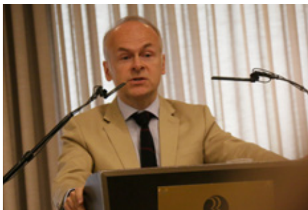
Tomas Sandell, President of the European Coalition for Israel at the Jerusalem GPC conference