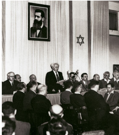
David Ben-Gurion (First Prime Minister of Israel) publicly pronouncing the Declaration of the State of Israel

In the three years in between 2015 and 2018, you have a number of other dates which seem to carry some kind of prophetic significance in light of biblical patterns of “ times and seasons ”: 40 years of one of the most devastating votes of the UN against Israel in November 2015 (Zionism = racism in Nov. 1975), 50 years of the reunification of Jerusalem in June 2017 (June 1967), 120 years of the first Zionist congress in August 2017 (August 1897), 100 years of the Balfour declaration in November 2017 (November 1917) and almost at the same time 70 years of the UN-vote in favor of the modern state of Israel in Nov. 29, 2017 (Nov. 29, 1947). More of such historically and prophetically important dates could be mentioned. Historic dates of national significance could be researched and added to the list. The common denominator all those future dates of commemoration have, is the potential for nations to turn towards them in a spirit of honor and respect, maybe even in a spirit of repentance towards Israel, or, alternatively, in a negative, more or less anti-Semitic spirit. This in turn is an opportunity as well as a challenge for the praying church worldwide to bless Israel and to pray for our nations and leaders that they would take those opportunities to honor Israel and the Jewish people.